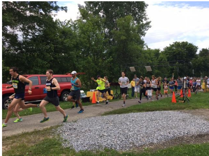
Runners set off on the Struble Trail in Downingtown.